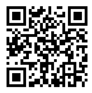
Explore Poreč at...